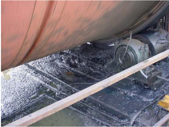
Drum Dryer: Before